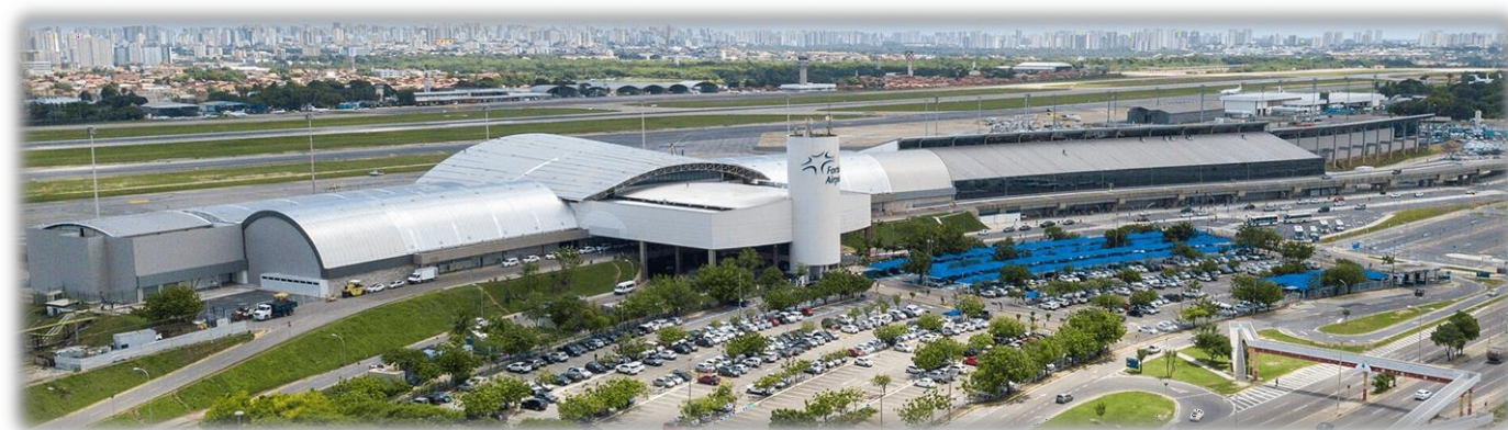
Photo 5 - Top view of Pinto Martins International Airport, located in the city of Fortaleza.

Pinto Martins Fortaleza International Airport is located in the city of Fortaleza and is one of the busiest airports in the northeast of Brazil ( Photo 5 ). It operates flights within the country and internationally to destinations in America and Europe. Although the state of Ceará has other smaller airports that operate directly in cities on the coast or with greater economic activity, Pinto Martins International Airport is the "gateway" to the state, with intense daily traffic. It is located in the middle of the map of Fortaleza, 9 km from the city center, 12 km from the city's main hotel chain on Avenida Beira-Mar and about 30 km from Cumbuco Beach, with daily transportation by bus, van, cab or app to this destination, which is the finishing point of the championship and where many athletes stay.