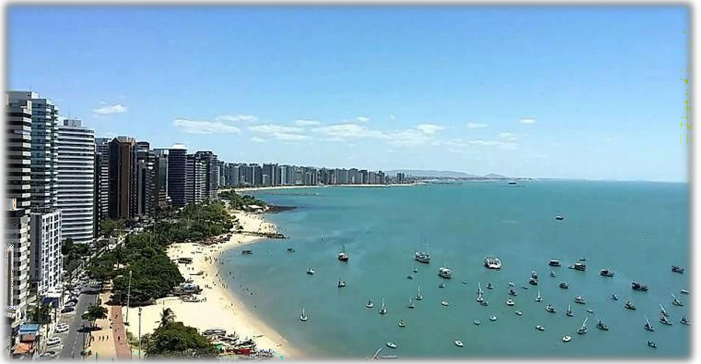
Photo 1: The Mucuripe cove in the city of Fortaleza is the starting point for the Molokabra Downwind rowing and canoeing races. As well as being home to the city's SUP, Va'a, Paddleboard and Surfski schools and bases, the region has a vast network of inns and hotels, as well as various options for gastronomy, leisure, musical performances, comedy shows and the sale of typical local products.

The finish line of the championship is Praia do Cumbuco, located in the city of Caucaia, which lies to the west of Fortaleza ( Caucaia (CE) | Cidades e Estados | IBGE ). The race course measures approximately 30 to 32km (it can vary depending on the competitor's choice of navigation route). Transportation from Fortaleza to Cumbuco is very quick and accessible, and can be done by car, bus, by app or by transfers from the tour companies that run this route directly from Pinto Martins International Airport, located in Fortaleza.