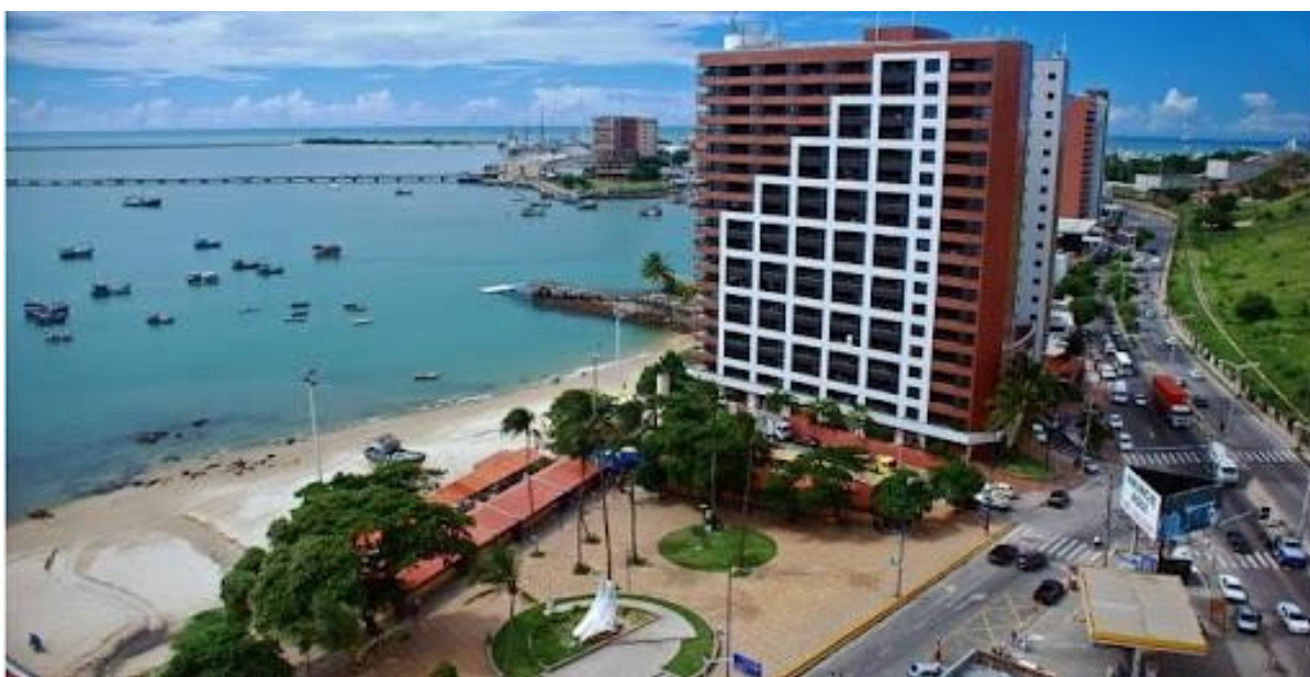
late Plaza Hotel. Located in Fortaleza, close to the starting point of the competitions.

Whether you choose to stay in Fortaleza or Praia do Cumbuco is a very individual choice, and it's up to each competitor to make a choice according to their profile. Both choices are fantastic and we recommend that you get tips from the veteran athletes at MolokaBRA before making your choice. To obtain special discounts, contact our organization or directly through the communication channels (website and social networks) of the places indicated, informing them that you are registered with MolokaBRA.