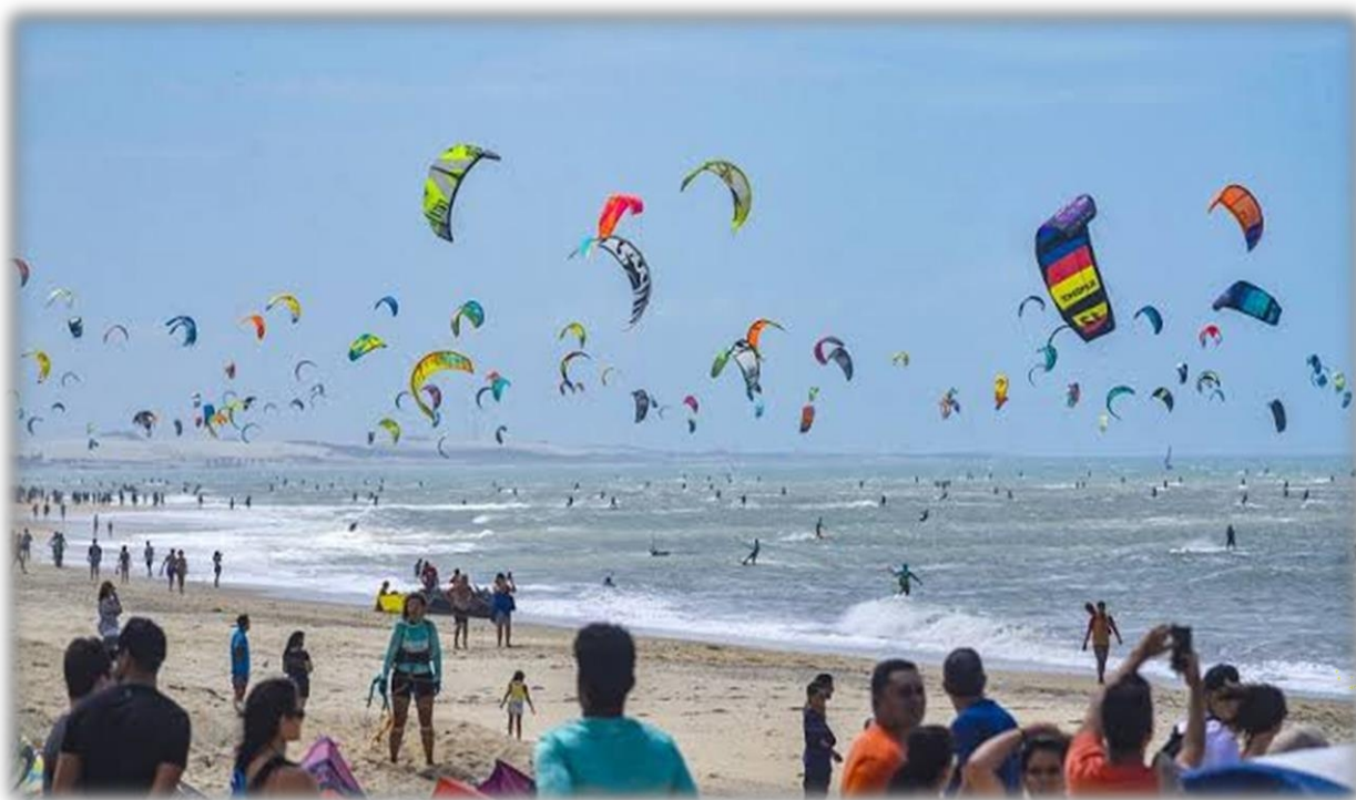
Photo 2: In 2022, Praia do Cumbuco broke the world record with the official Guinness Book record of 882 sailors attending the kiteparade together. The previous record, set in 2019, already belonged to the area, which shows the great influence and impact that the winds have on the beach, attracting sailors and paddlers from all over Brazil and abroad.

such as Oscar Chalupsky (South Africa), Greg Barton (USA) and Tupuria King (New Zealand), who took part in the competition in 2021, 2022 and 2023 respectively, have spoken publicly about their positive impressions of the conditions at the site, helping to promote Molokabra globally.