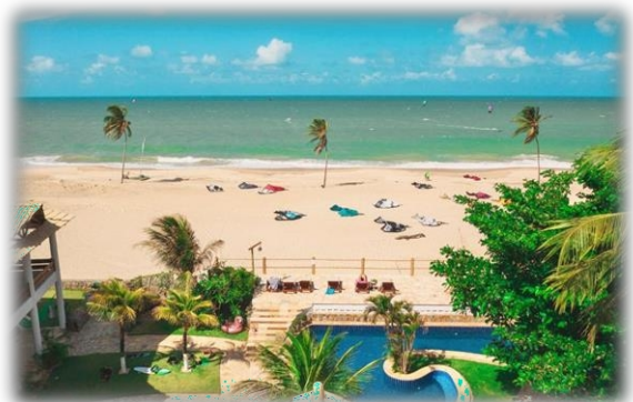
Windtown Pousada on Cumbuco Beach. Arrival point and support site for the event.